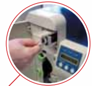
Easy Change Ribbon Cassette